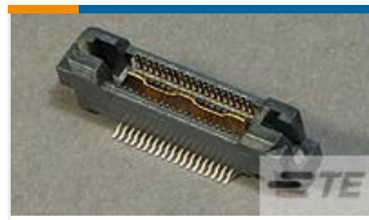
TE Part # 5767119-1 MICT,PLG,038,ASY,.025,TAPE PKG