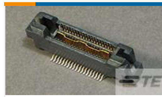
TE Part # 5767119-8 MICT,PLG,038,ASY,.025,TAPE PKG