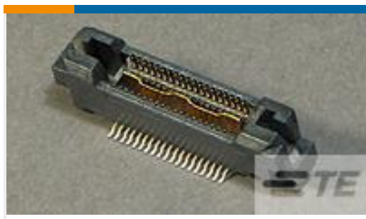
TE Part # 5767118-8 MICT,PLG,038,ASY,.025,TAPE PKG