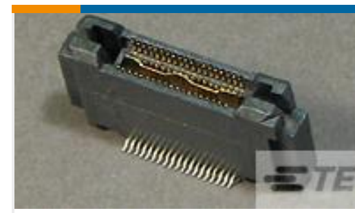
TE Part # 5767120-1 MICT,495PLG,038,ASY,.025,AUPLT